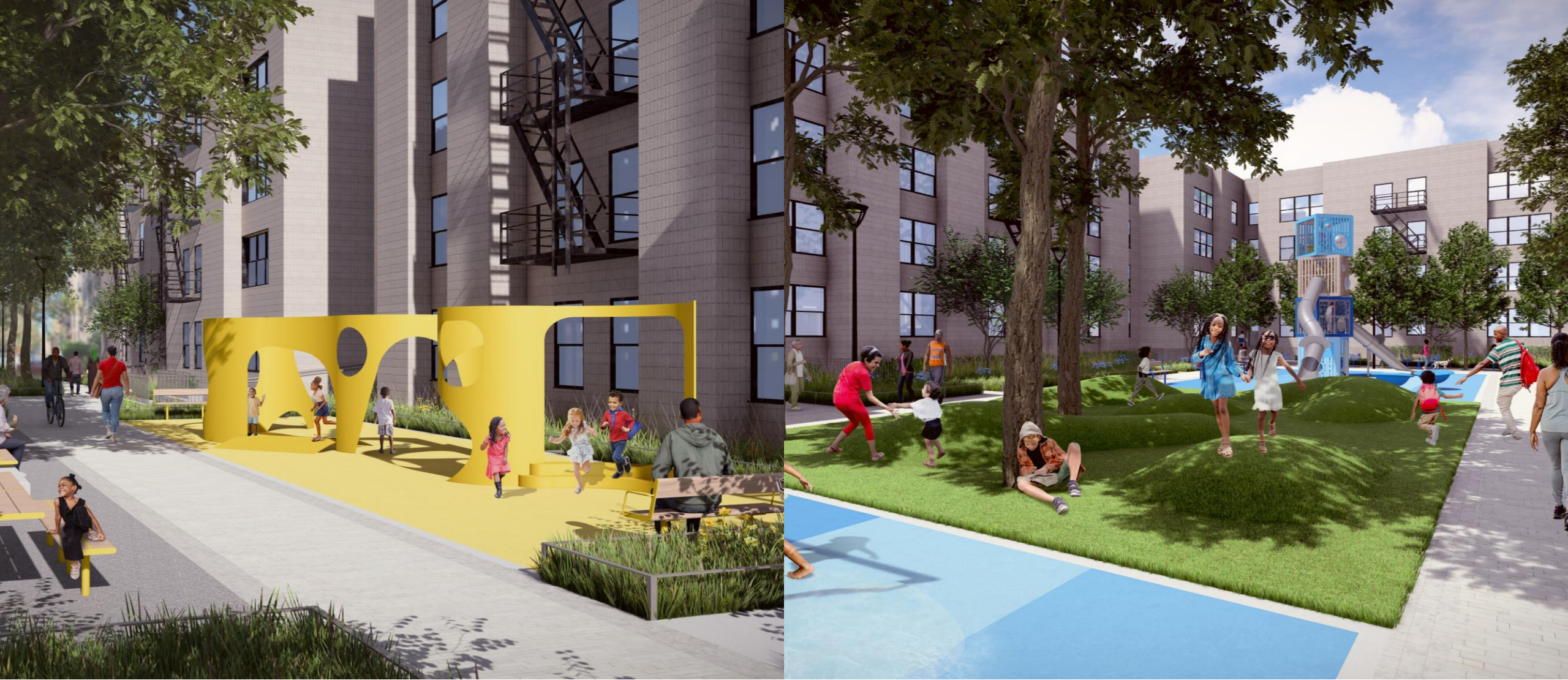
Outdoor Space Rendering Example (draft – not final)