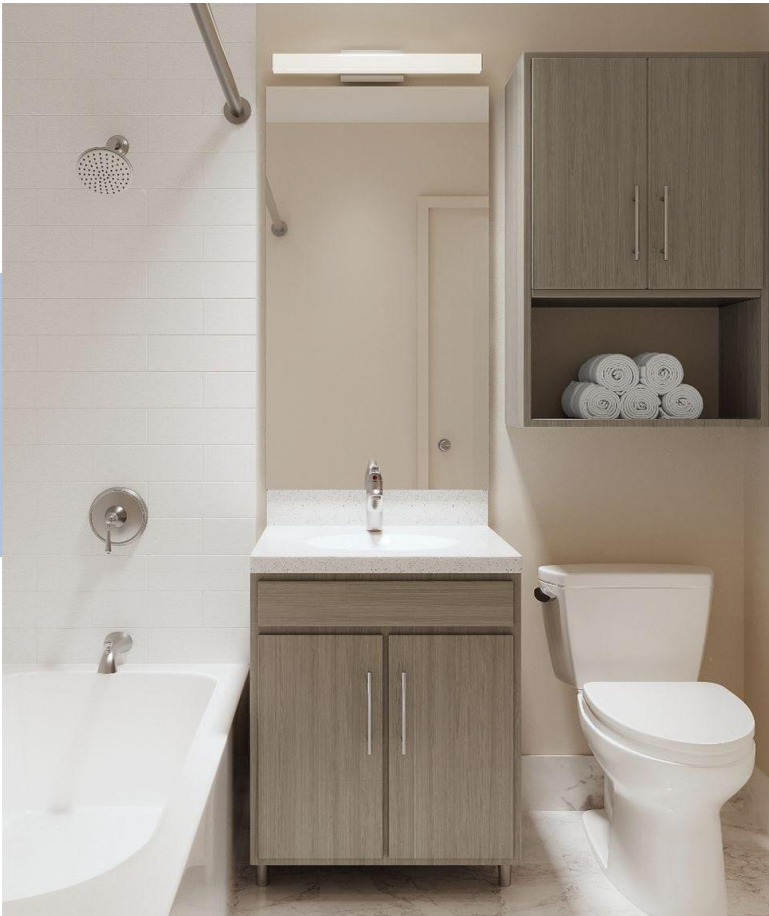
Basic Bathroom Render

Model Apartments Tours Took Place on 10/30 & 11/6