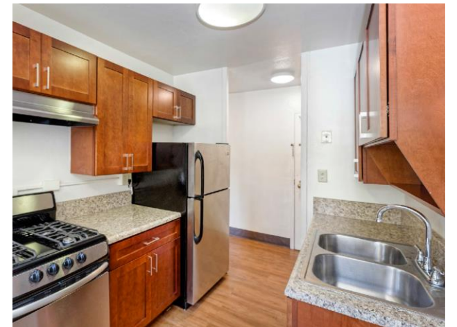
Ocean Bay (Bayside)