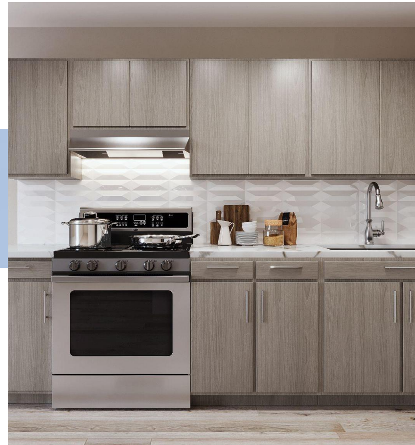
Basic Kitchen Render