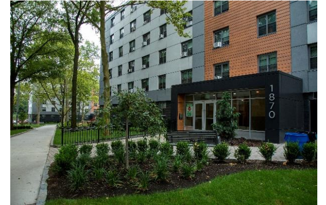
Site improvements at Baychester