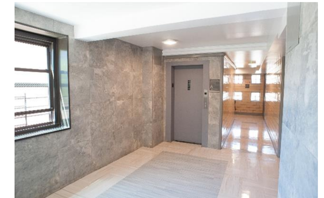
Renovated building entrance at Ocean Bay (Bayside)