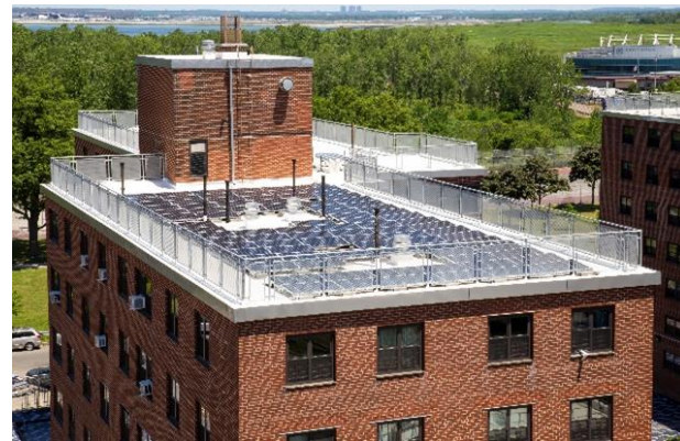
Repaired roof and solar panel system at Ocean Bay (Bayside)