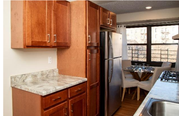
Renovated apartment at Twin Parks West