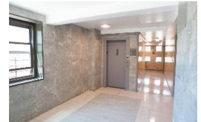
Entrada del edificio renovado en Ocean Bay (Bayside)