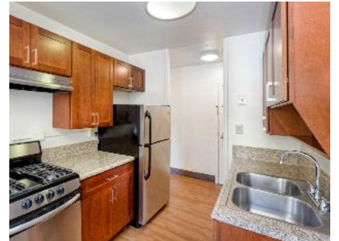
Ocean Bay (Bayside)