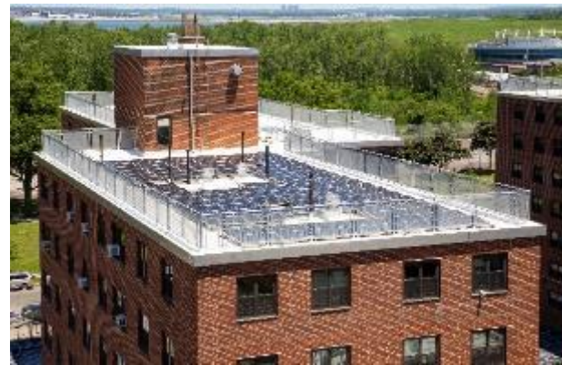
Reparación de techo y sistema de paneles solares en Ocean Bay (Bayside)