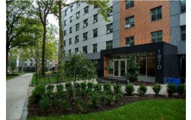
Mejoras en Baychester