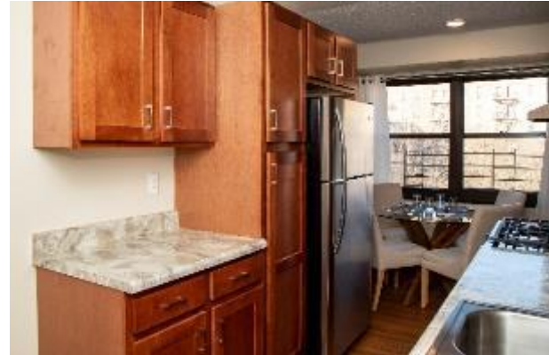
Apartamento renovado en Twin Parks West