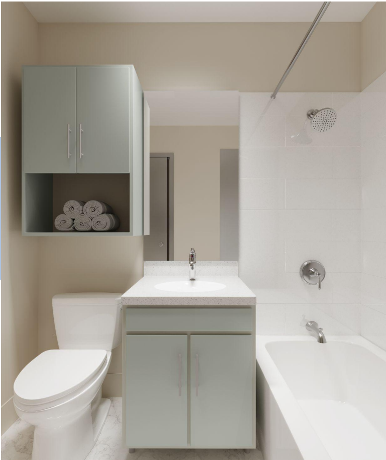
Render de baño básico

Se harán recorridos de los modelos de los apartamentos durante noviembre de 2024