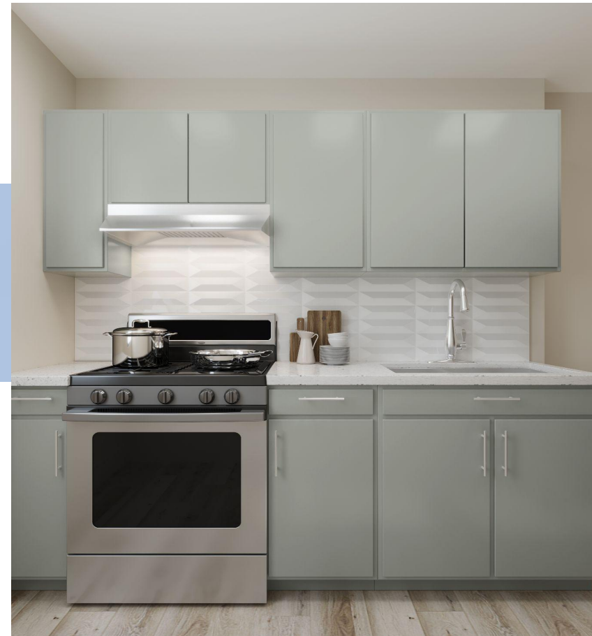
Render de cocina básica